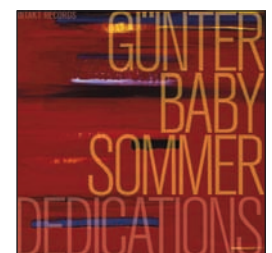
GÜNTER BABY SOMMER DEDICATIONS Intakt CD 224