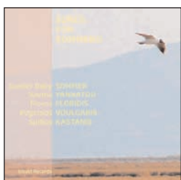
GÜNTER BABY SOMMER SONGS FOR KOMMENO Intakt CD 190