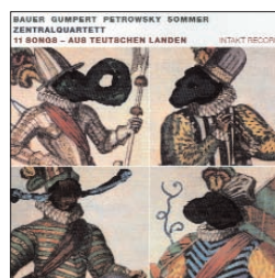
ZENTRALQUARTETT 11 SONGS Intakt CD 113